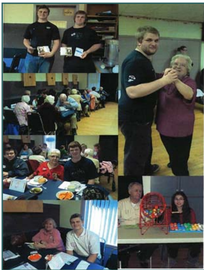
Seniors & Teens Day at ACE