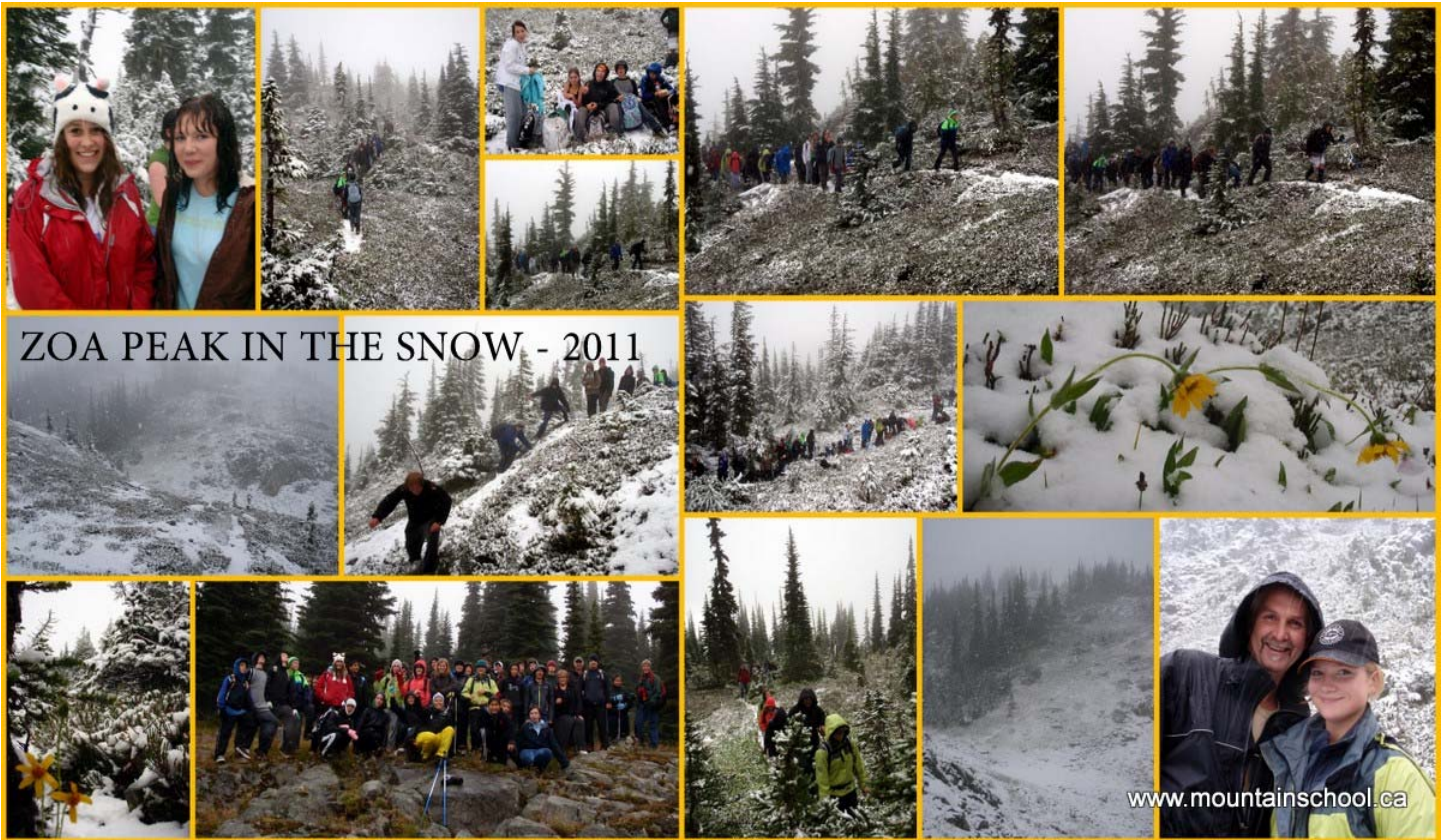
ZOA PEAK IN THE SNOW - 2011