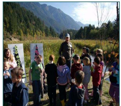
Coquihalla Elementary - Science 4 Wetlands Program with Hope Mountain Centre for Outdoor Learning